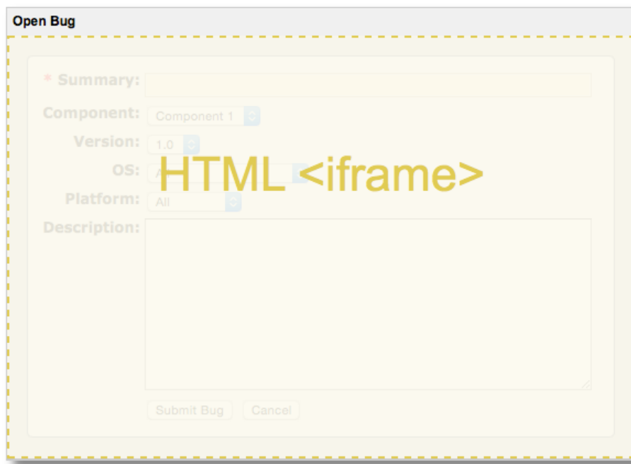
Fig. 2 Dialog iframe

Clients might choose to place dialogs inside page elements styled to look like a dialog window.